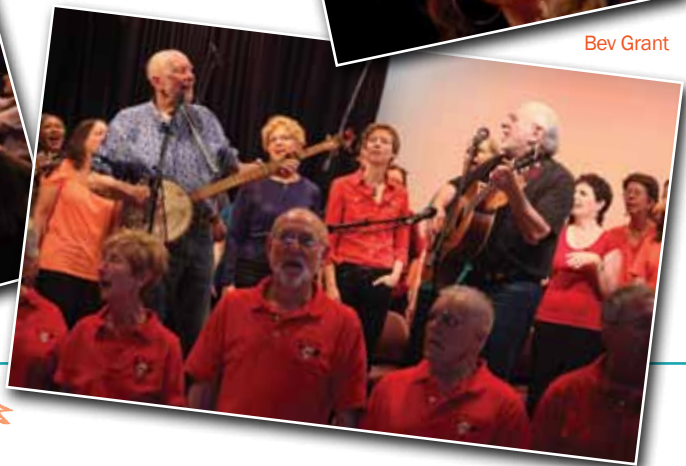
Pete Seeger (left) and Peter Yarrow with NYC Labor Chorus members in foreground and on stage.