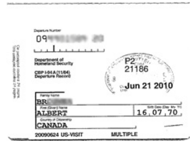
Example of an I-94 Card

Extension definition: same petitioner, same performers, same venue as was approved by the USCIS the year before. There cannot be a lapse in the status you are requesting to extend. In other words the current P2 or P2S visa cannot expire while you are applying to extend the visa. Please include a copy of your previous P2/P2S approval notice(s), a copy of all musicians/essential support I-94 Departure Record Cards (front and back) with your application forms. If applicable, please provide your temporary US address.